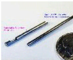
2mm Needle scope with mirror tube detached