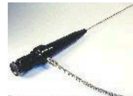
Our Needle scope uses any of our light sources by attaching a light guide cable

Specifications subject to change without notice