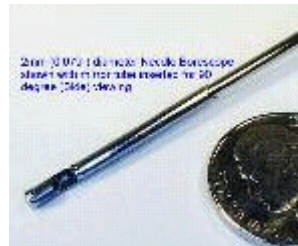
Side view mirror tube inserted over Borescope